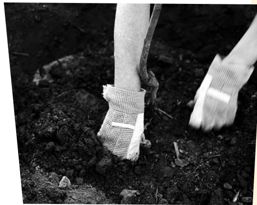
Don't be afraid to hold and work your soil by hand. You can learn about its needs this way.

Because all organic materials are constantly being decomposed by soil organisms, even the best soil will benefit from frequent applications of organic amendments. Among these soil amendments are: ground bark, peat moss, leaf